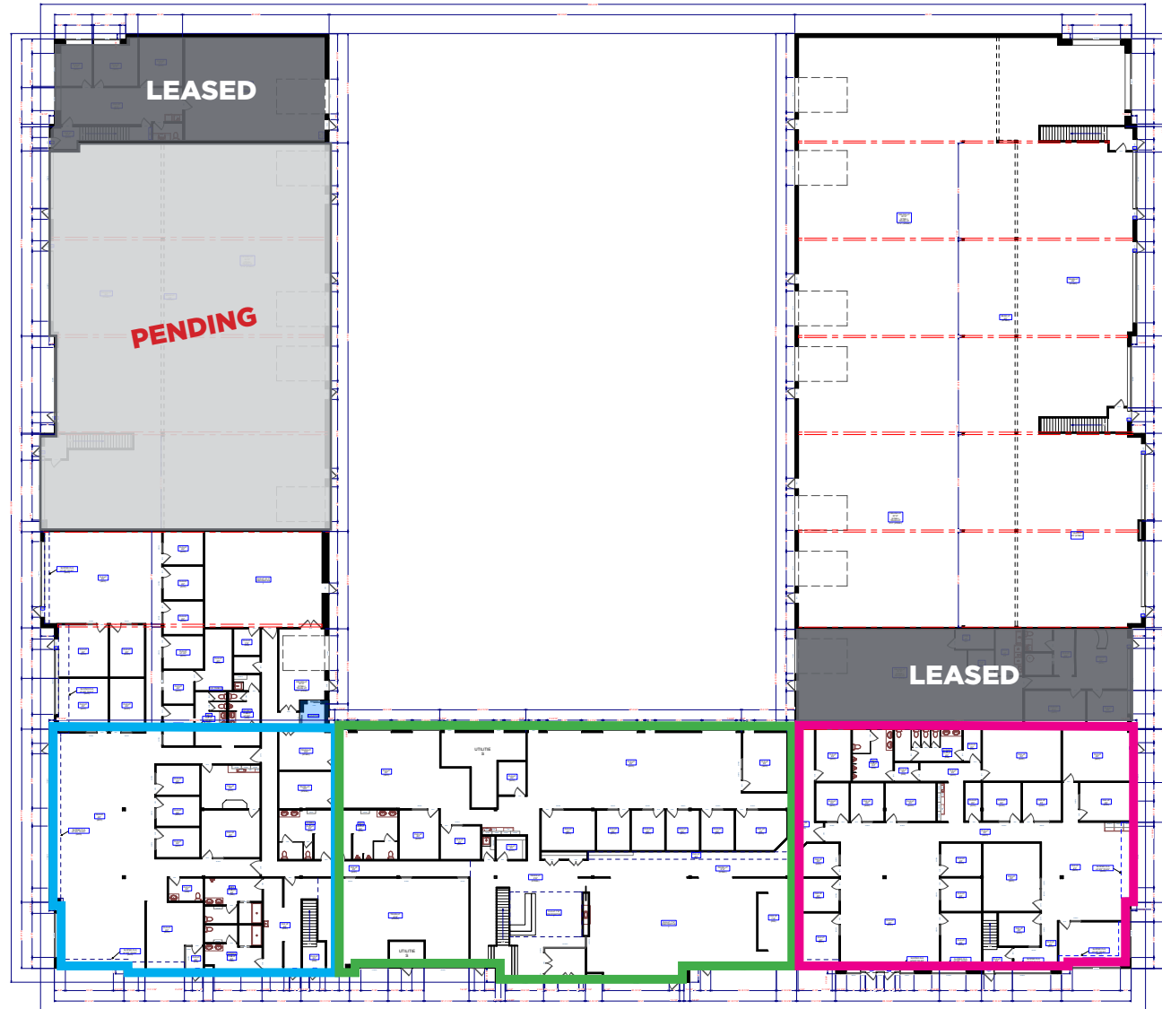
UNIT 8 MAIN 5,683 SF